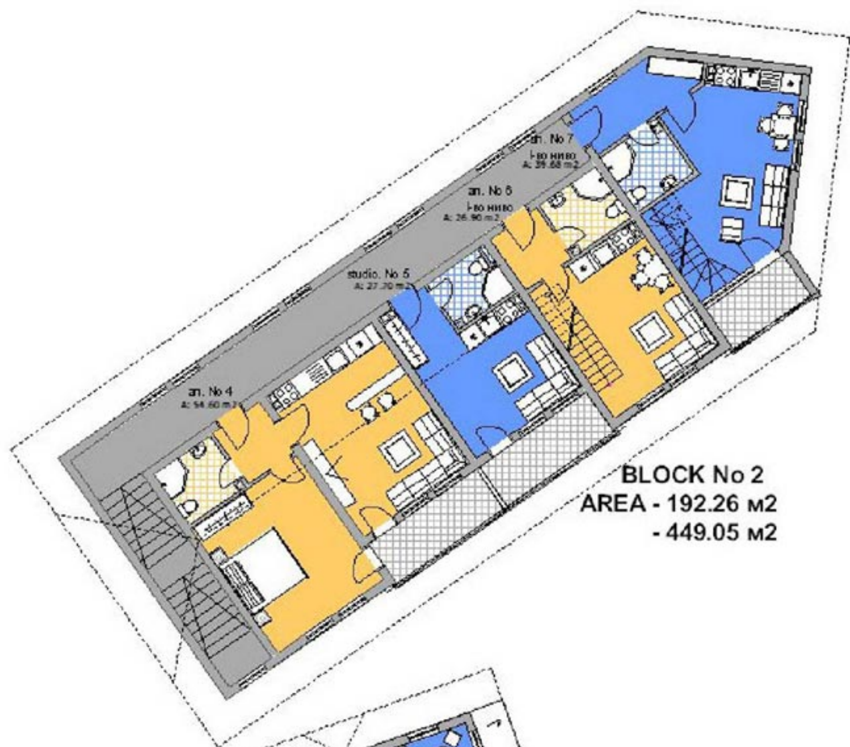
BLOCK No 2 AREA - 192.26 m 2 - 449.05 m 2