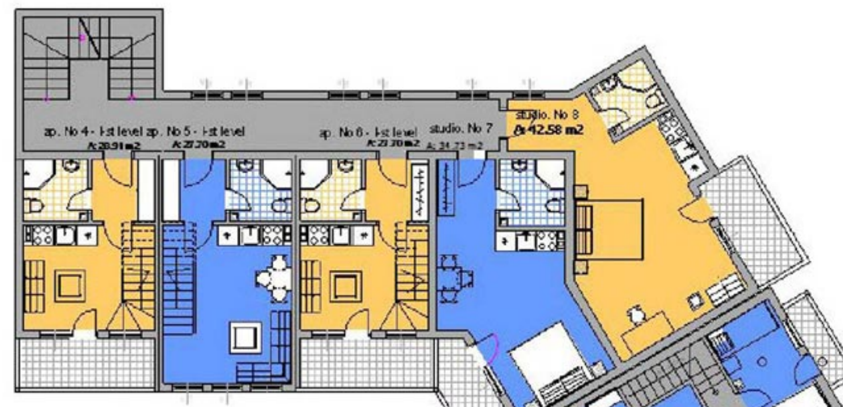
BLOCK No 3 AREA - 154.86 m 2 - 648.16 m 2