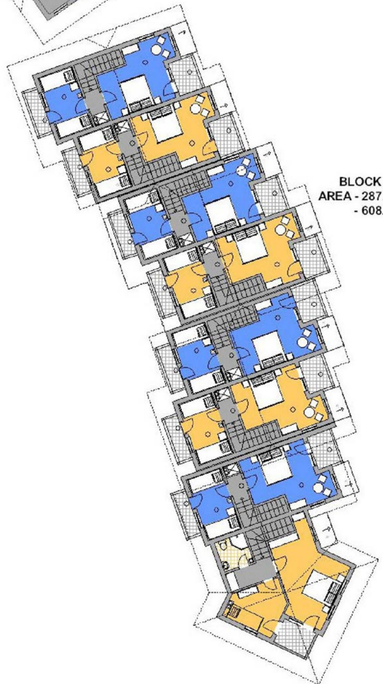
BLOCK No 1 AREA - 287.20 m 2 - 608.38 m 2